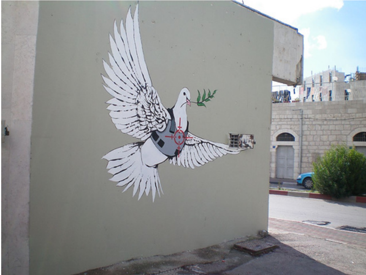
“Peace Dove.” Photo taken December 22, 2007.