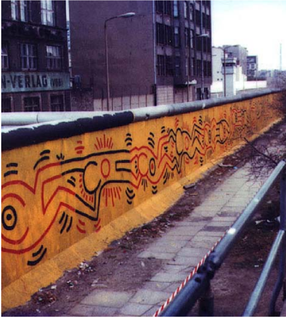
Keith Haring October 23, 1986