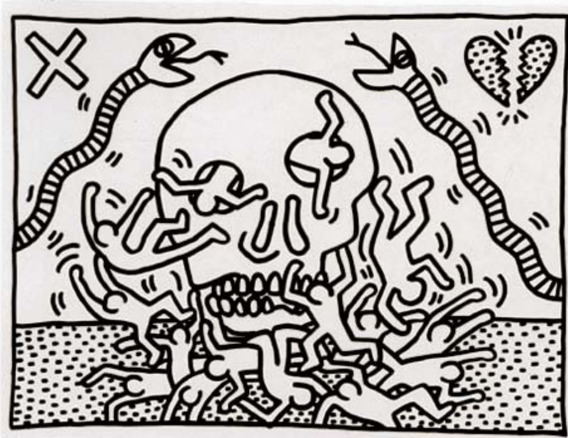
Keith Haring Untitled, 1983 Ink on Paper 41 x 52 inches