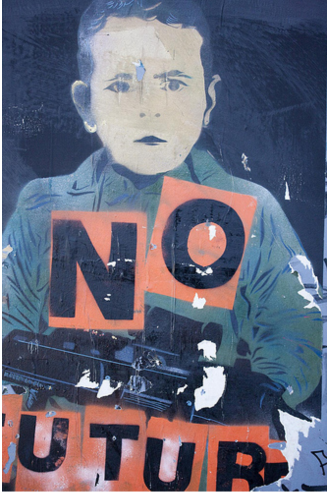
"No future on streets of Dublin"