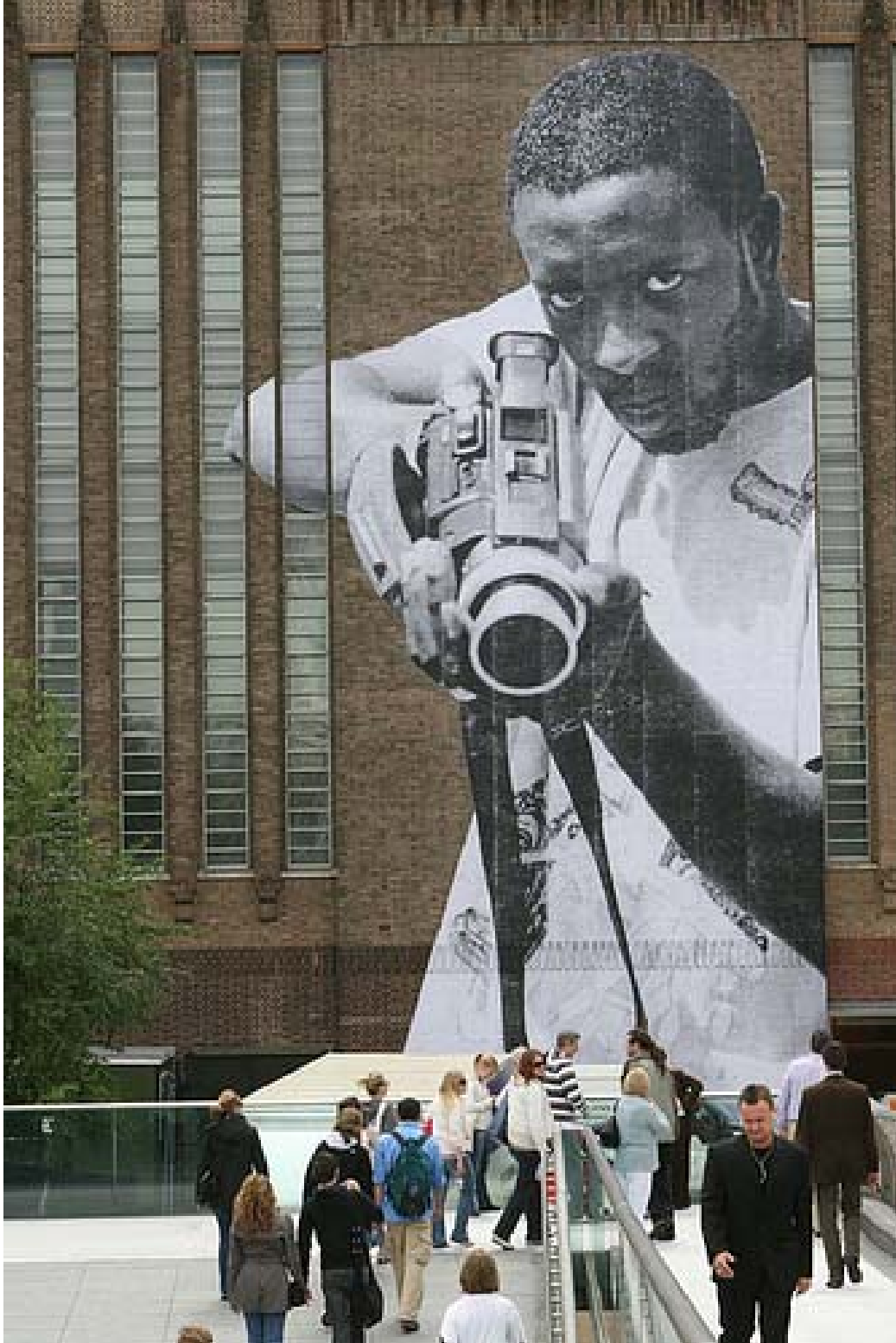
Image created by JR. Picture taken by "Alan Bee." Picture taken May 27, 2008