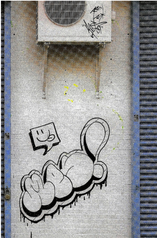
Picture taken by "Lois in Wonderland." Picture taken February 24, 2010. Retrieved from Flickr.com