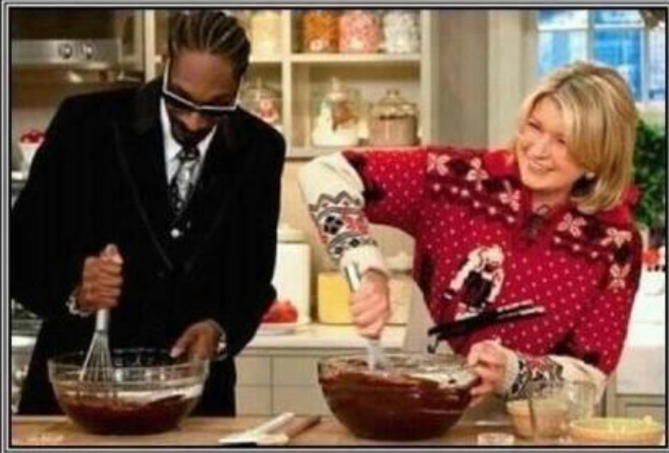
Image of Snoop Dogg and Martha Stewart

BE MINDFUL ABOUT STEREOTYPES! ONLY ONE OF THEM IS A CONVICTED FELON.