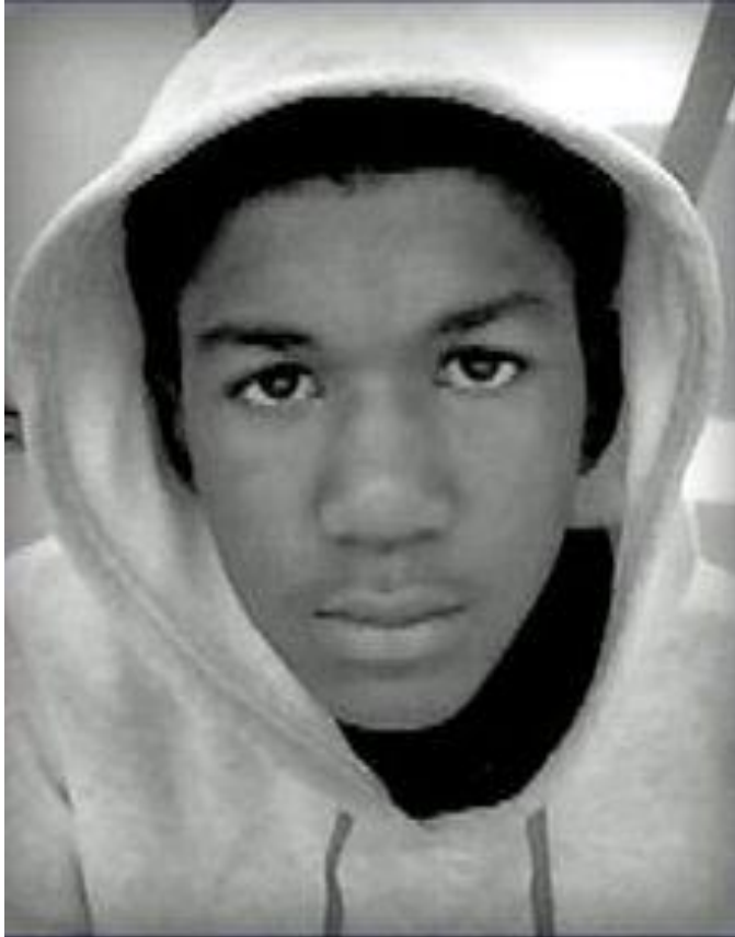
Image of Trayvon Martin